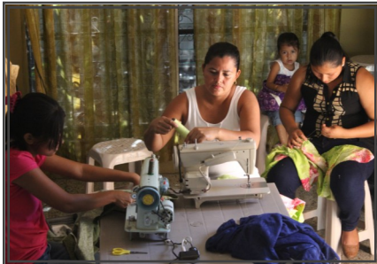
Sewing classes are going strong.