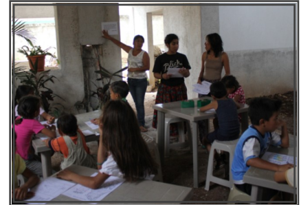
Our children's ministry is growing.