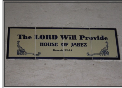
He is our SOURCE of all!