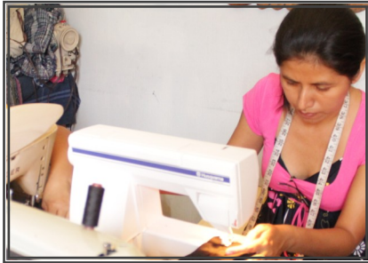
Sewing Class at Carol's House