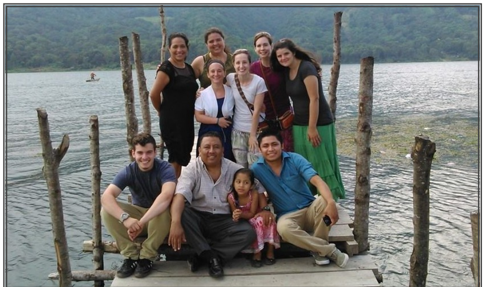
Groundzero Master's Commission and Operation Jabez Team at Lake Atitlan