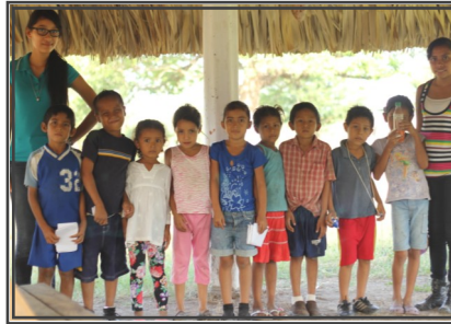
Children's Ministry in San Antonio